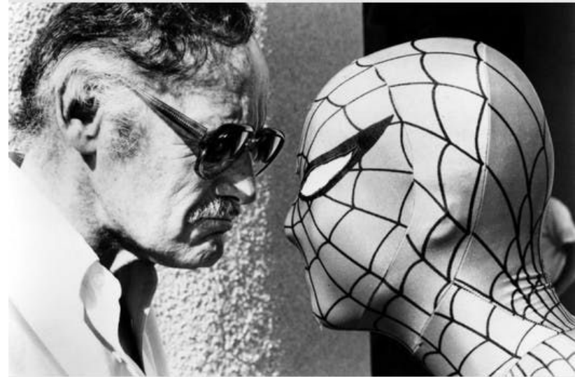
Spiderman Theme - D-F E